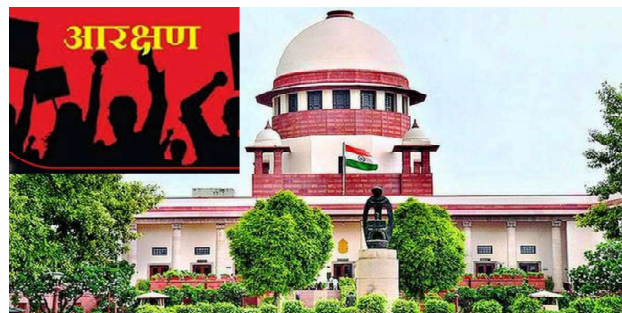
The Supreme Court's decision to allow 27 percent reservation to OBC in elections to local bodies has quelled the tension in the political arena in Maharashtra.