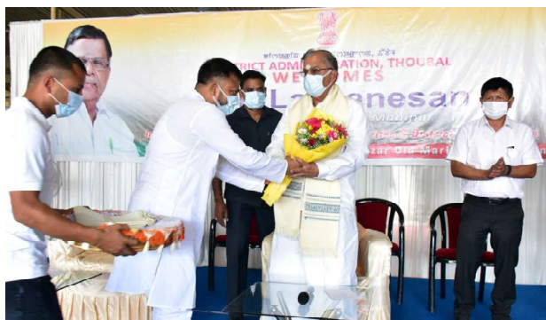
IT News Imphal, July 31:

Governor of Manipur La. Ganesan today visited Lilong Sub-Division in Thoubal District and interacted with District Level Officers (DLOs), representatives of Civil Society Organisations and student leaders. In the interaction programme held at Lilong Bazar, Governor heard the grievances and issues faced by the people