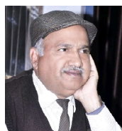
By: Vijay Garg

Amidst the hustle and bustle of social media, the declining fascination for books among the new generation of children is a matter of serious concern. More and more children are confined to the books of the school curriculum. The burden of the bag gives them less opportunity to read books on different subjects.